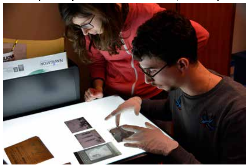
Fig. 2. A moment of shadowing between student interns in Planning and Management of Cultural Tourism working on the museum photographical archive in 2016.

On a more general level, this experience gave university students the possibility to discover and investigate pieces of heritage originally handled by their colleagues in the past or created or used by former university professors—the possibility, one can say, to tighten the bond between past and present. To test whether the internship actually activated such awareness, the survey included two questions, one asking generically