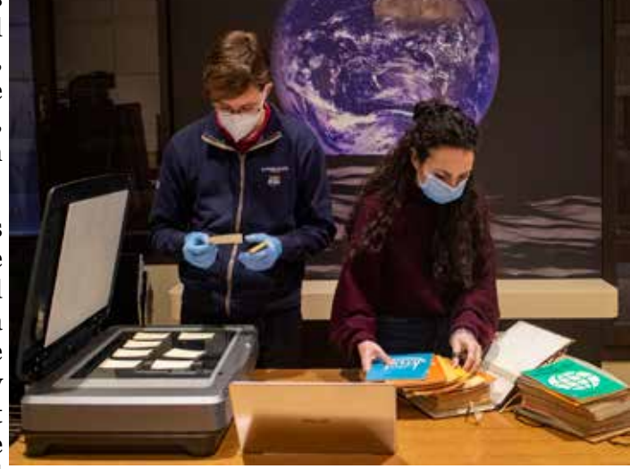
Geography in 2021.

Even though the internship programme was determined by almost unique conditions, we decided to treasure the experience as good practice, and to repeat it, albeit adapted to a different phase of the museum's life cycle: the difference with today's internships lies not only in the number of trainees that can be hosted at one time, but also in the kinds of tasks they are entrusted with; these are currently more focused Fig. 3. Trainees working in-presence in the Discovery Room of the Museum of on communication and digitization.